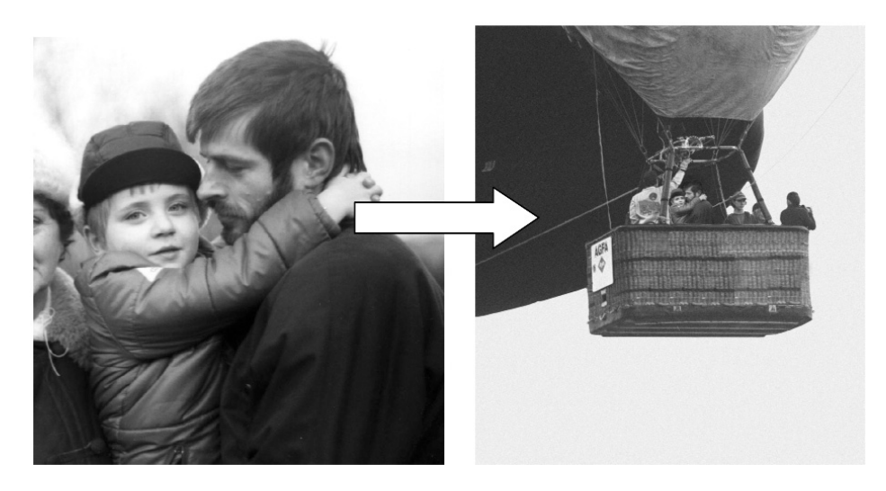
Figure 2. Process of doctoring a photo: source photo (left panel) and doctored photo (right panel).